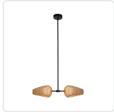
PD20602-BK/OP Black/Opal Matte Glass